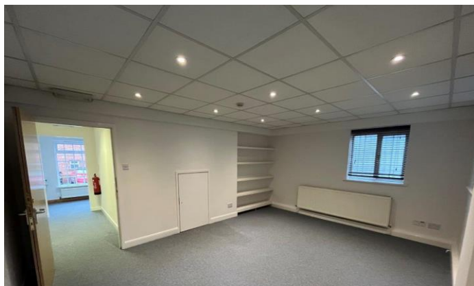
Ground Floor Office/Storage