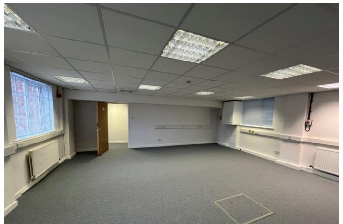
Ground Floor Office