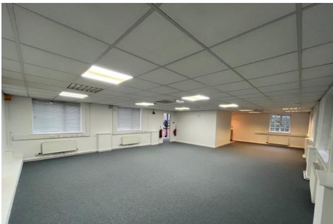
First Floor Office with Kitchenette Area