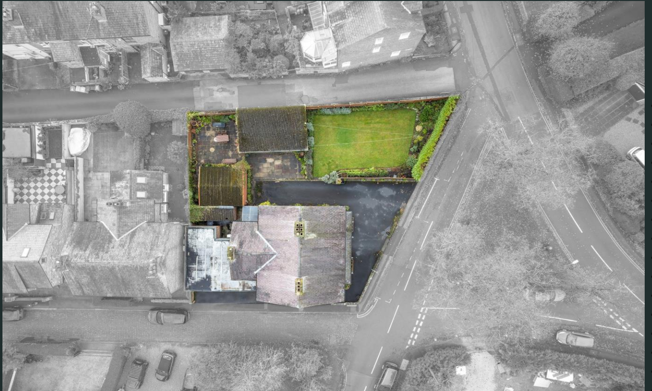
68 Hayes Lane, Alderley Edge SK9 7HY