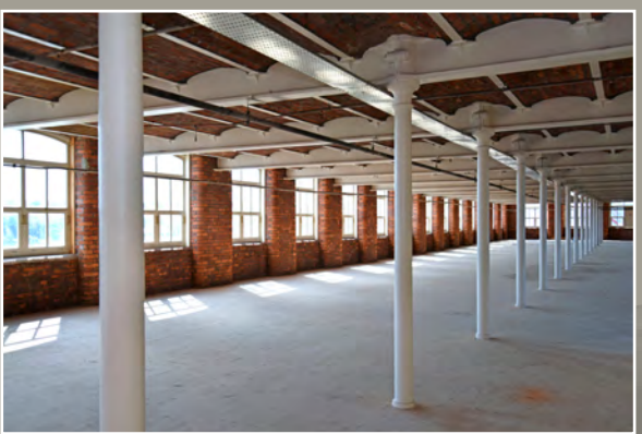
Refurbished space prepared for fitout